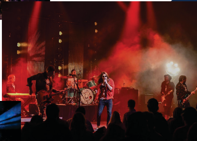
The Glorious Sons