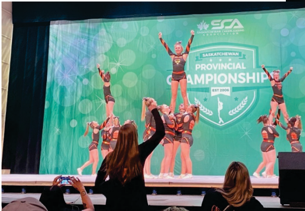
Saskatchewan Cheerleading Provincials