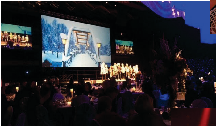
Hospitals of Regina 4 Seasons Gala